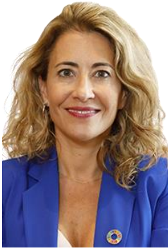
Hon. Raquel Sánchez Jiménez

Minister for Transport, Mobility and Urban Agenda Spain