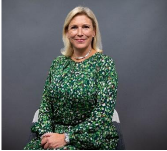
Baroness Vere of Norbiton OBE

Parliamentary Under Secretary Department for Transport (DfT) United Kingdom